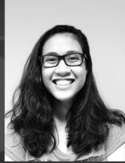
LIANA AS ACTOR 2