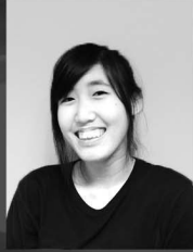
BEAURICE AS ACTOR 3