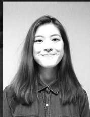
CHERYL AS A